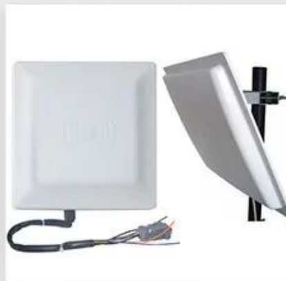
Long Distance UHF Reader