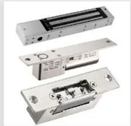
Door EM Lock

Shenzhen Goldbridge focus on innovation R&D production and sales of IOT RFID products and application solution, rfid reader category including UHF desktop reader writer, UHF integrated reader, UHF R2000 fixed reader, UHF OEM module, RFID handheld reader, uhf rfid tags, active 2.4G rfid reader, EM 125KHZ Long range reader, industrial RFID hardware and integrated software, obtained the national high-tech enterprise certification FCC, CE and ROHS.