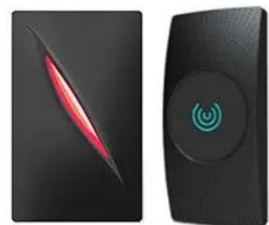
Access Control Reader