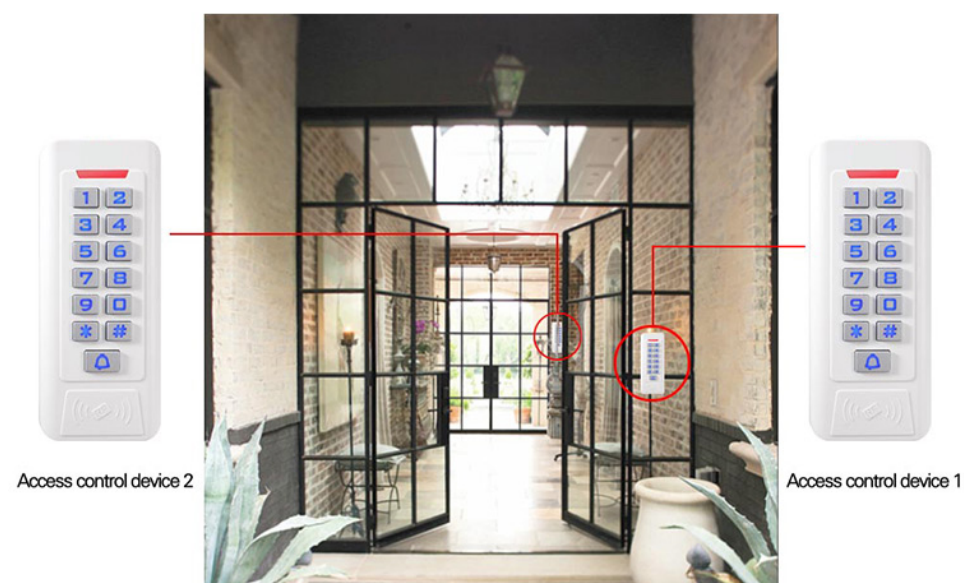
Access control device 2

Bright And Clear Like Sun And Star Digital Backlit Keypad