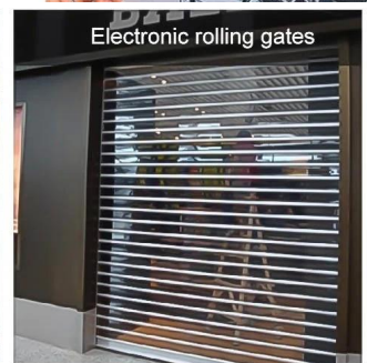
Electronic rolling gates