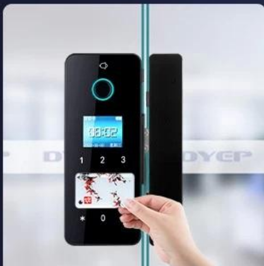
Swipe card to unlock