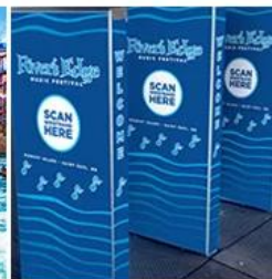
Exhibition & Conference