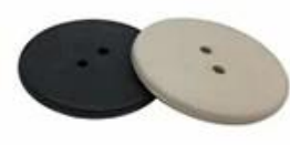
Laundry Washable RFID Tag