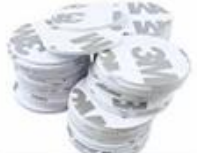
ID/IC Dia 25mm