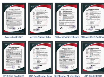
Access Control CE Access Control RoHS EM Lock EMC Certificate EM Lock RoHS Certificate RFID Card Reader CE RFID Card Reader RoHS UHF Reader CE Certificate UHF Reader RoHS