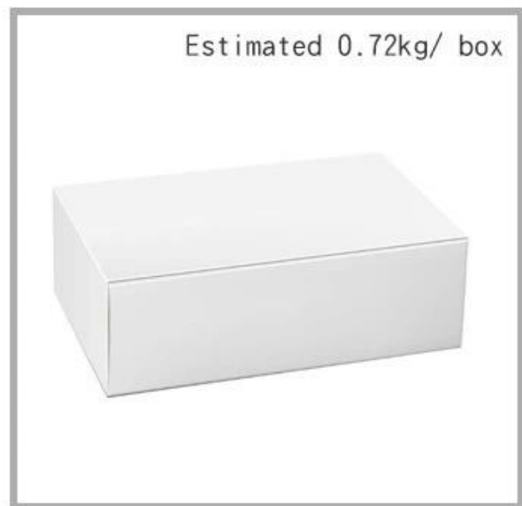
Estimated 0.72kg/ box