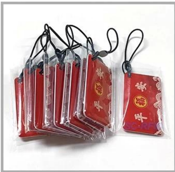
Plastic bag: 10 sheets/strip

All cartons and cartons are supported by high-quality materials to ensure transportation