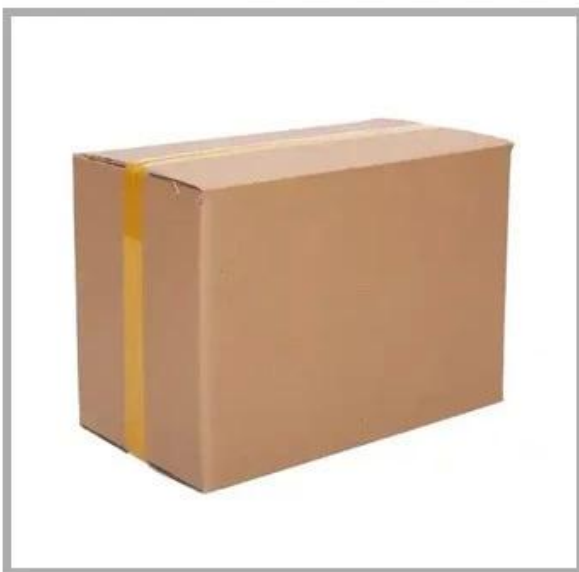
FCL: 25 boxes/box