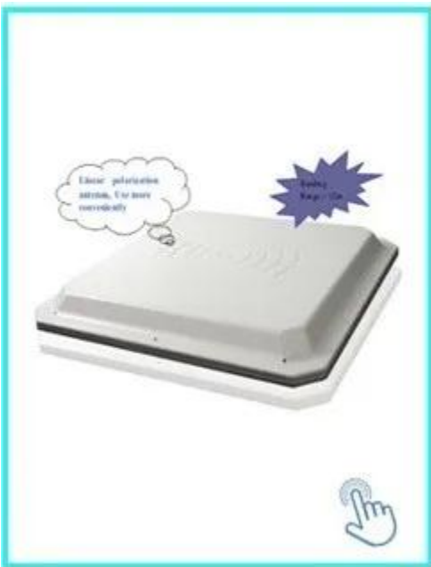
ACM802A 8-10m reading range UHF reader Wiegand 26 output, RS232/485