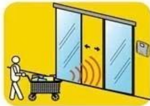
Asset ID management