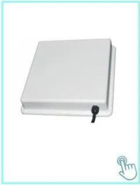
ACM812A 2-5m reading range UHF reader Wiegand 26 output, RS232/485