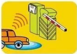
Vehicle access control system