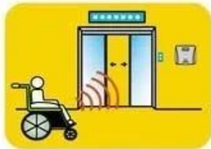
Hand free applications