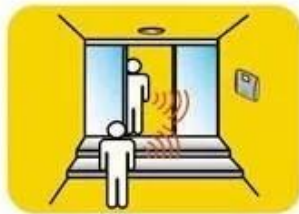
Personal ID access control