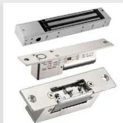
Door EM Lock

Shenzhen Goldbridge concentra-se na inovação, R&D, produção e vendas de produtos IOT RFID e soluções de aplicação, categoria de leitor de RFID incluindo UHF desktop reader writer, UHF integrado reader, UHF R2000 fixo, UHF OEM module, RFID handheld reader, uhf rfid tags, active 2.4G rfid reader, EM 125KHZ Long range, industrial RFID hardware e integrado, obteve a certificação nacional de empresa de alta tecnologia FCC, CE e ROHS.