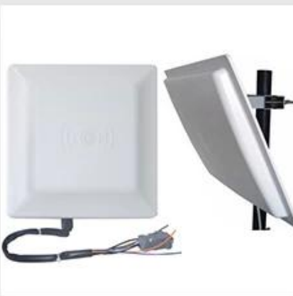
Long Distance UHF Reader