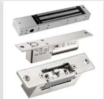
Door EM Lock