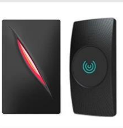
Access Control Reader