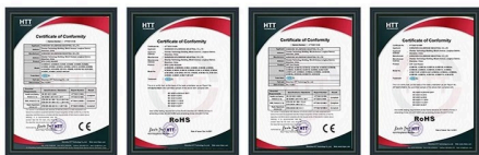
RFID Card Reader CE RFID Card Reader RoHS UHF Reader CE Certificate UHF Reader ROHS