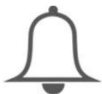
Doorbell for the visitors