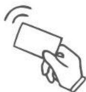
EM Card / Mifare Card