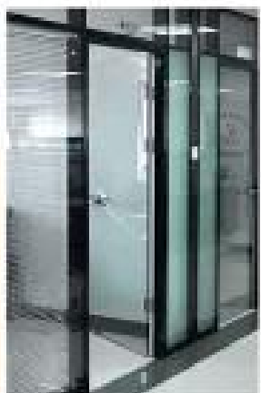
Glass Door with Frame