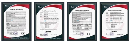
RFID Card Reader CE RFID Card Reader RoHS UHF Reader CE Certificate UHF Reader ROHS