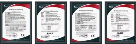
RFID Card Reader CE RFID Card Reader Rohs UHF Reader CE Certificate UHF Reader ROHS