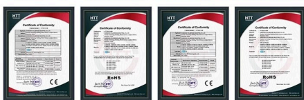
RFID Card Reader CE RFID Card Reader RoHS UHF Reader CE Certificate UHF Reader RoHS