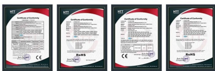
Access Control CE Access Control RoHS EM Lock EMC Certificate EM Lock RoHS Certificate