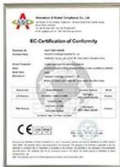
CE Fingerprint Access Control