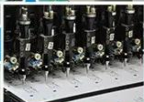
Auto antenna winding