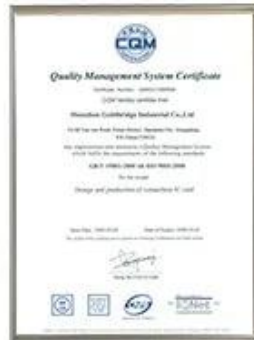
ISO90001 Certificate FOR COMPANY