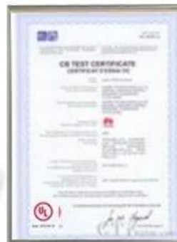
UL Certificate for Locks