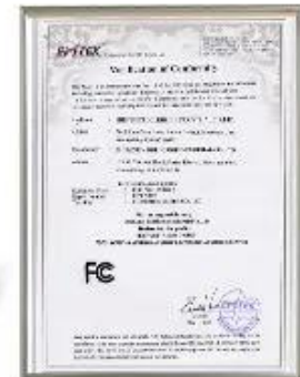
FCC fingerprint access control