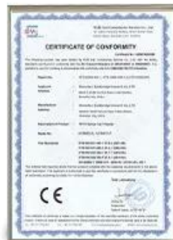
CE UHF Long Range Reader