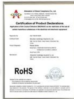
RoHS RFID Reader