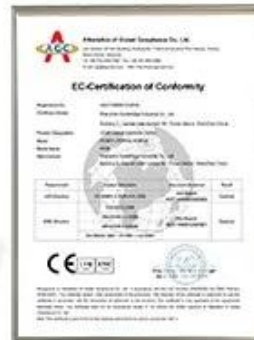
CE Certificate for ACM Access Control Board