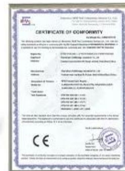
CE - RFID Readers