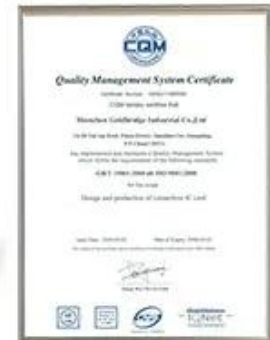
ISO Certificate of RFID Manufacturer