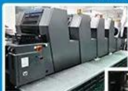
Heidelberg offset printing machine