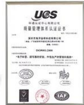
UCS Quality Certificate for RFID Cards rfid reader