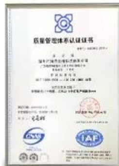
Certificate for manufacturer of RFID Cards