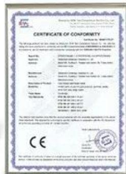
CE RFID smart cards