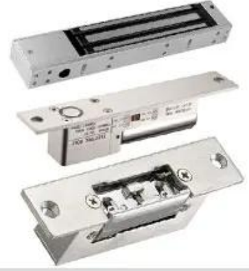
Door EM Lock

Shenzhen Goldbridge, inovasyon Ar-Ge üretimine ve IOT RFID ürünlerinin ve uygulama çözümünün satışına odaklanır, rfid okuyucu kategorisi UHF masaüstü okuyucu yazar, UHF entegre okuyucu, UHF R2000 sabit okuyucu, UHF OEM modülü, RFID el okuyucu, uhf rfid etiketleri, aktif 2.4G rfid okuyucu, EM 125KHZ Uzun menzilli okuyucu, endüstriyel RFID donanımı ve entegre yazılım, ulusal yüksek teknoloji kurumsal sertifika FCC, CE ve ROHS aldı.