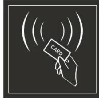
ID EM Cards