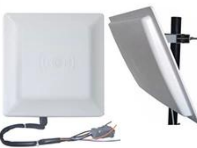
Long Distance UHF Reader