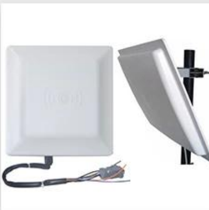
Long Distance UHF Reader