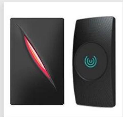
Access Control Reader