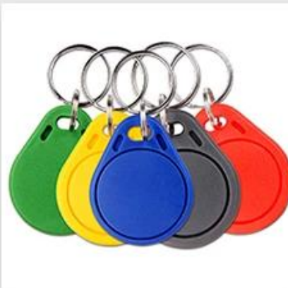
RFID Key fob