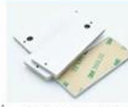
Anti-metal tag 95*25mm